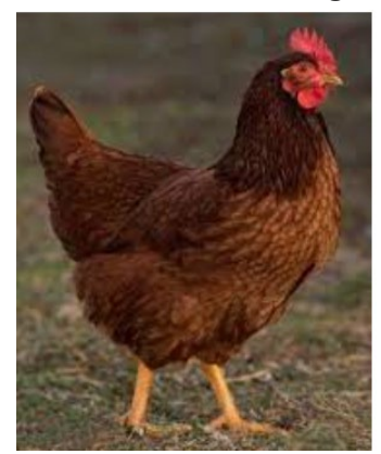
Red feathers (RR or Rr)

Let's look at the following feather colors for chickens.