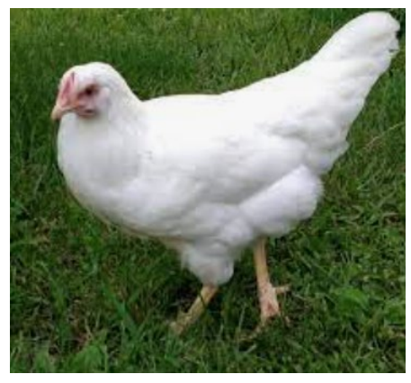
White feathers (rr)

Investigate patterns of feather inheritance in chickens using the Punnett squares below.